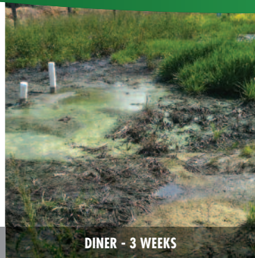
DINER - 3 WEEKS