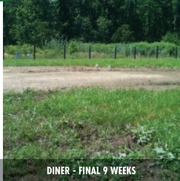
DINER - FINAL 9 WEEKS

RESULTS FROM USING ECOHANCER™ AT RED LION DINER IN SOUTHAMPTON, NJ